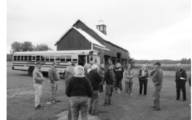
Participants listen to the host explain the history of his barn

We are losing many of these barns and other buildings every year, so it is essential to identify and catalog what remains, and assist owners preserve and protect these unique Wisconsin icons.