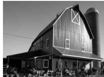
Tour is rain or shine!

Please dress appropriate for the weather and to visit working farms!