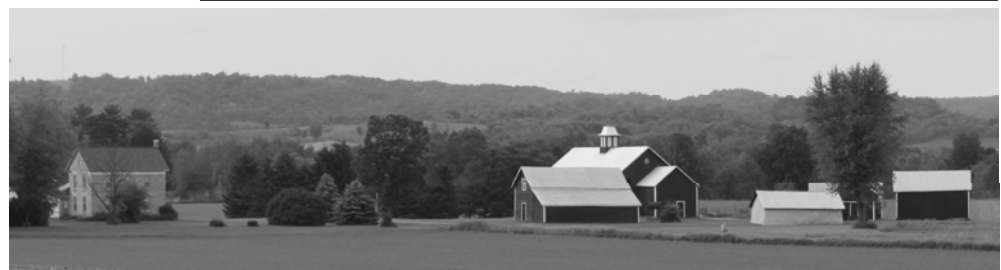
A classic and well maintained Wisconsin farmstead north of Galesville.

Yes! I/We will attend the Trempealeau County - Barn Preservation Tour